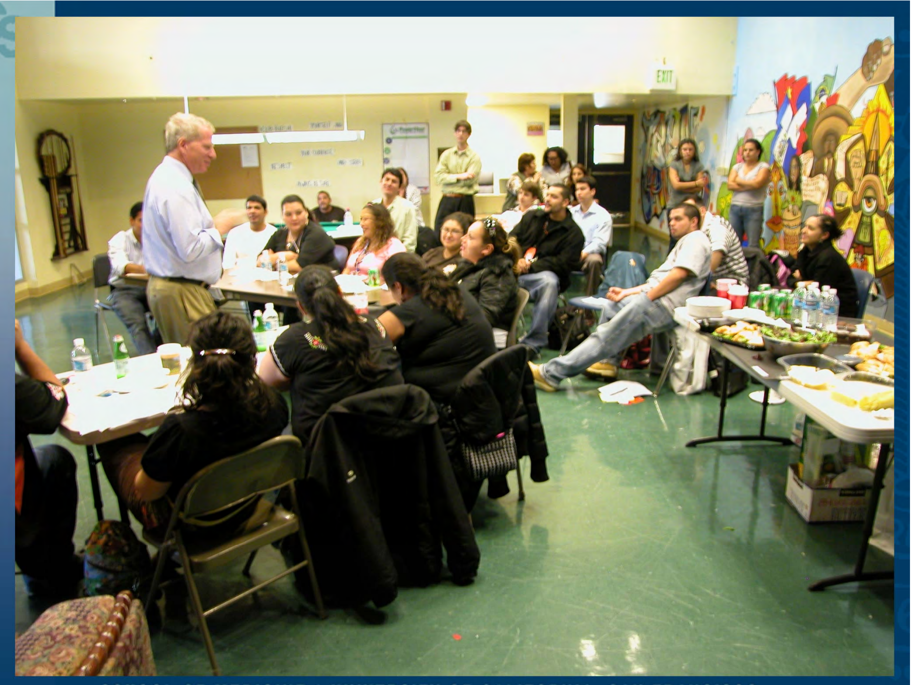
SCHOOL OF MEDICINE * UNIVERSITY OF CALIFORNIA, SAN FRANCISCO